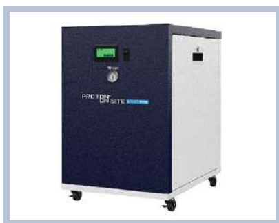
Proton On Site Nitrogen N341m