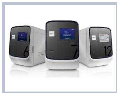
Thermo Applied Biosystems Molecular Testing