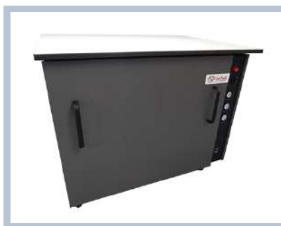
Quiet Mass Spec Box And Table