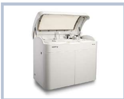
Clc 800 Drug Screening Chemistry Analyser

5525 Twin Knoll Rd Ste 323 Columbia, MD 21045