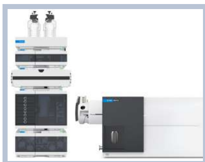
Thermo Endura Triple Quad Mass Spectrometry