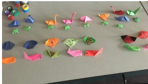
Bruckner Nature Center