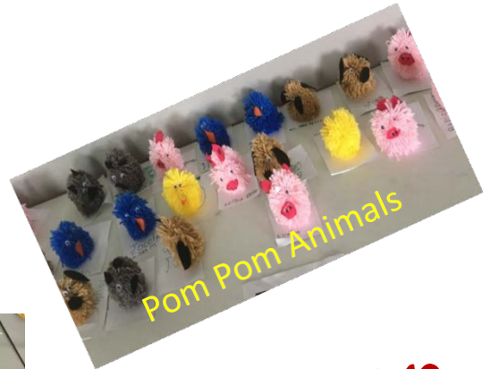
Pom Pom Animals