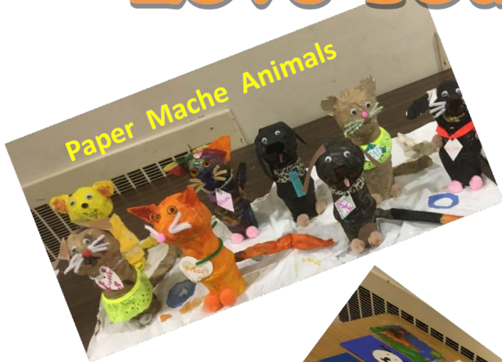
Paper Mache Animals