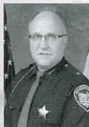
Sheriff Al Solomon