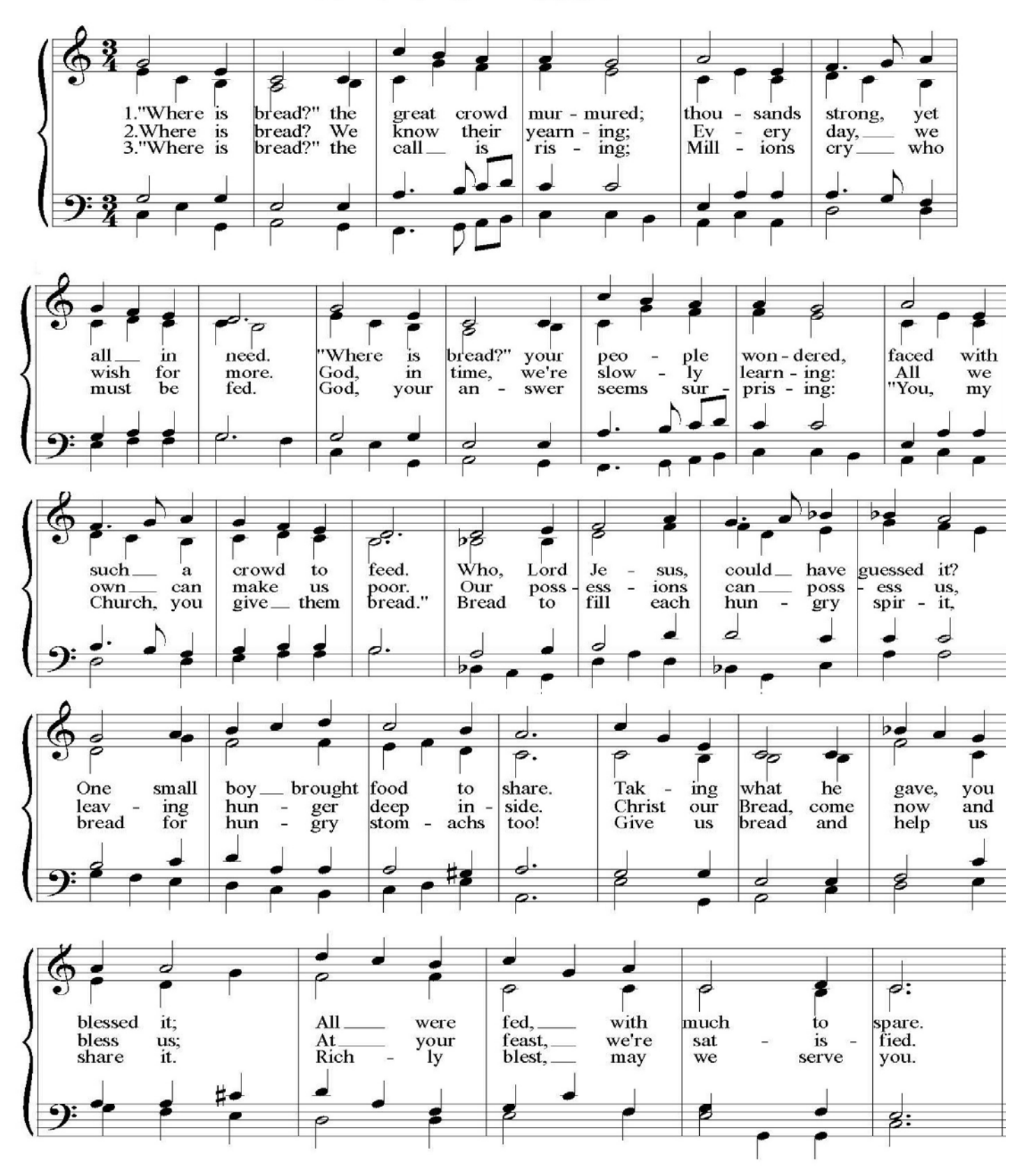
PRAYER HYMN Where Is Bread? Where is Bread?

Let us pray: God, we thank you that you have given us the beautiful colors in creation all around us. Prompt us to see your beauty, that we might respond with prayer. Amen.