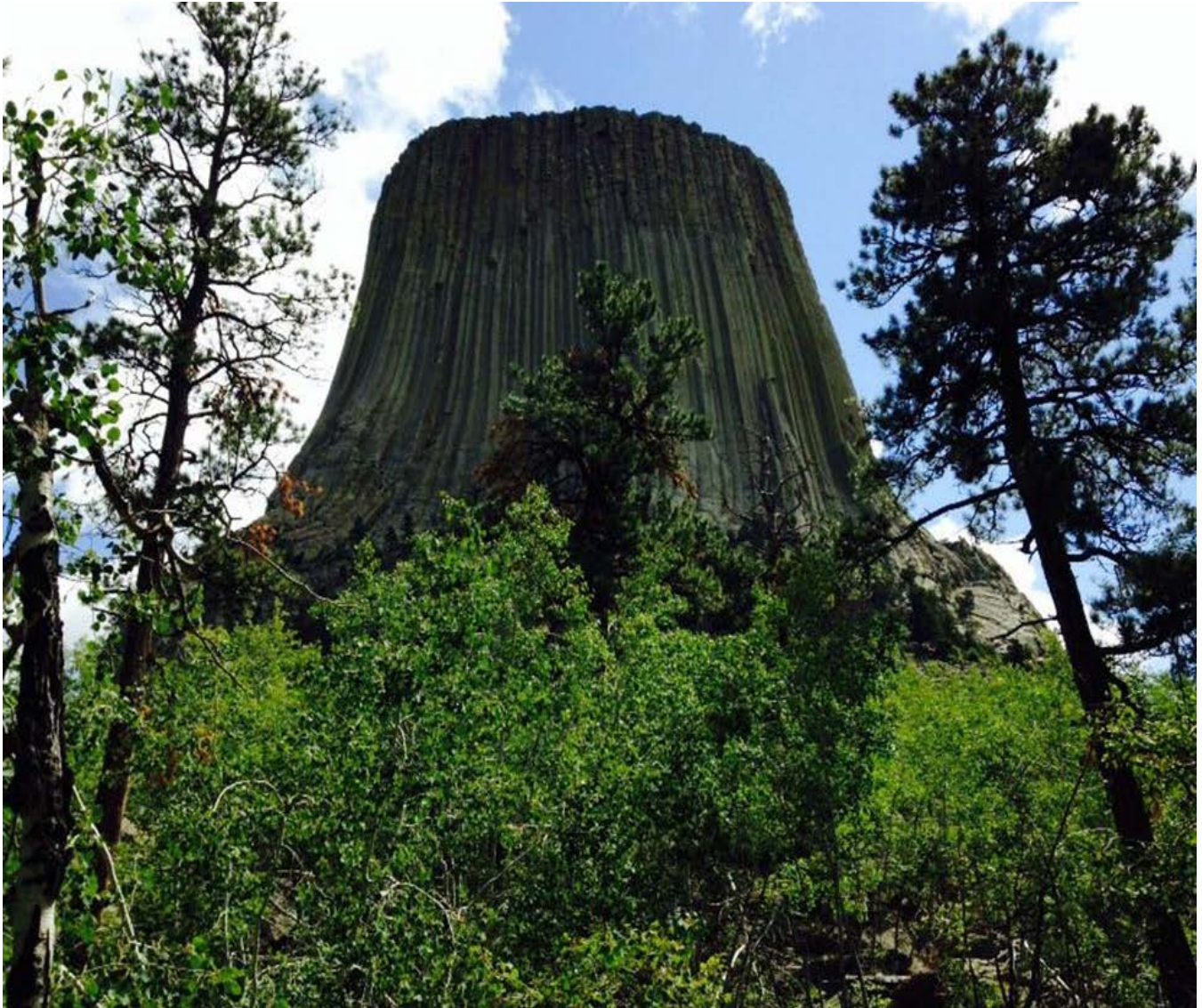
Devils Tower, Wyoming