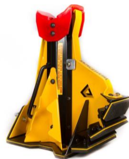
TJ470 (Leopard) – 30 Ton Capacity

“Simple, safe, and preserve3s our shop floors. I love Trestlejacks. They are awesome!” 12/2018 (SSG/NG)