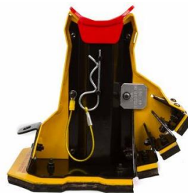
TJ220 ADJ (Meerkat) – 6 Ton Capacity