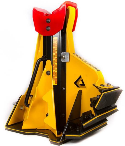
TJ470 (Leopard) – 30 Ton Capacity