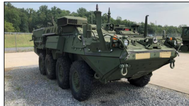
Stryker M-1126 ICV and its Family of vehicles lifted by Trestlejacks adopts well..