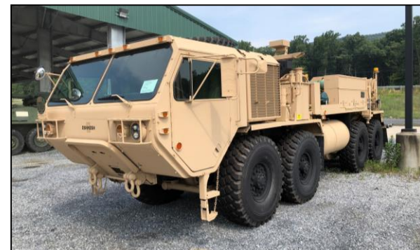
New Military TOW TRUCK