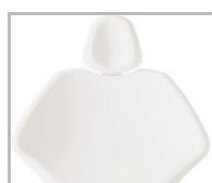
cod. 916 Bianco glitter