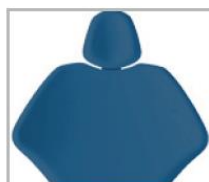
cod. 903 Carta da zucchero