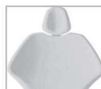
cod. 915 Metallizzato