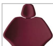
cod. 923 Bordeaux