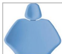
cod. 901 Azzurro