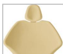
cod. 921 Nocciola