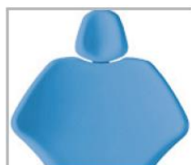
cod. 902 Celeste