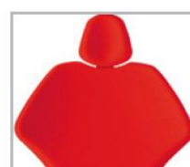
cod. 925 Rosso

Via Rossini, 26 - 40055 Villanova di Castenaso (BO) Tel. 051 780 465 - Fax 051 781 625 info@eurodent.it