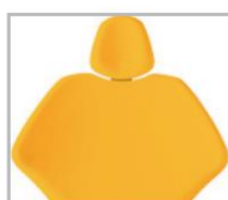
cod. 908 Giallo