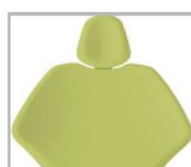
cod. 919 Verde glitter