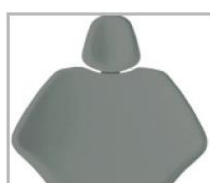
cod. 912 Fumo di Londra