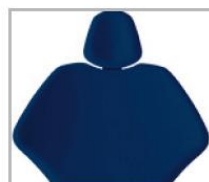
cod. 904 Blu