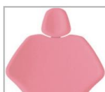
cod. 918 Fuxia glitter