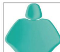
cod. 905 Acqua marina