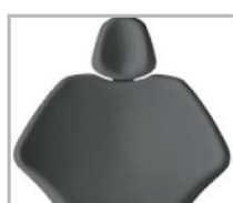
cod. 922 Grigio scuro