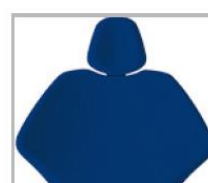
cod. 920 Blu glitter