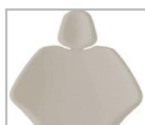
cod. 911 Grigio