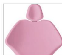
cod. 910 Lilla