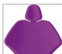
cod. 924 Mirtillo