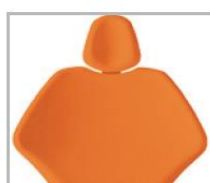
cod. 917 Arancio glitter