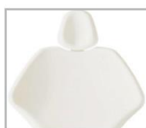
cod. 907 Ghiaccio