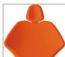
cod. 909 Arancio