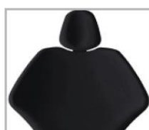
cod. 913 Nero