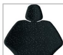
cod. 914 Nero glitter