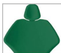
cod. 906 Verde