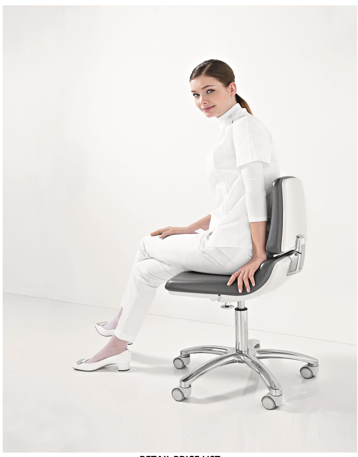
RETAIL PRICE LIST STOOLS 2022