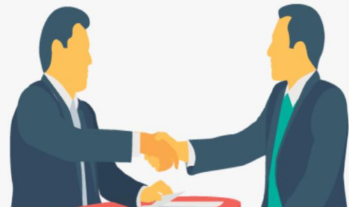
DIGITAL MARKETING EXECFUTURE