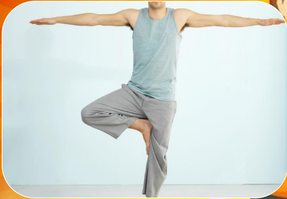
YOGA DRESS MEN