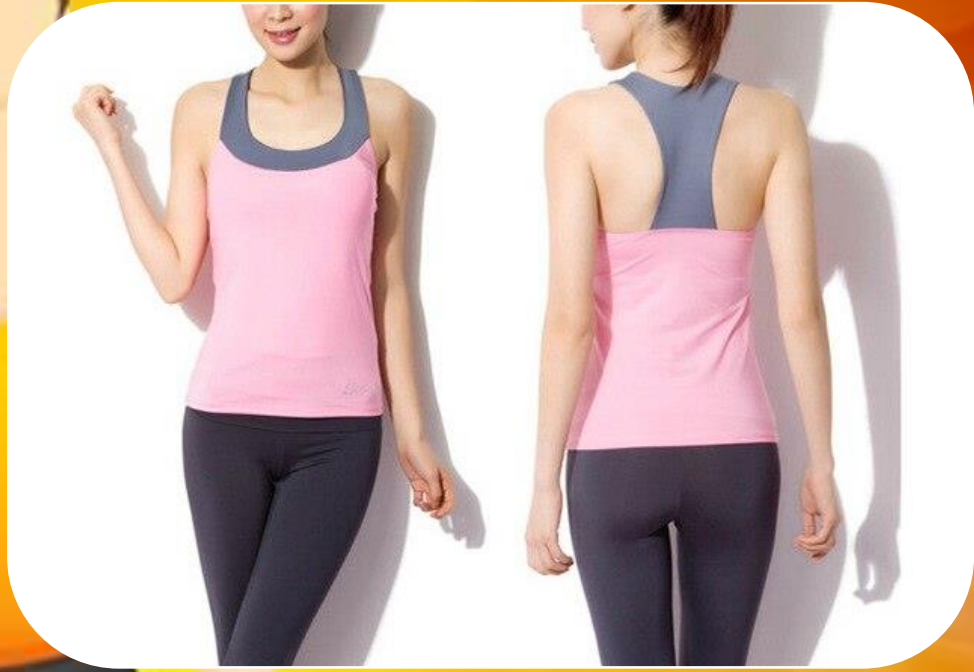
YOGA DRESS WOMEN