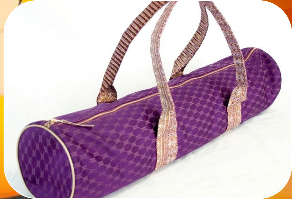
YOGA MAT BAGS