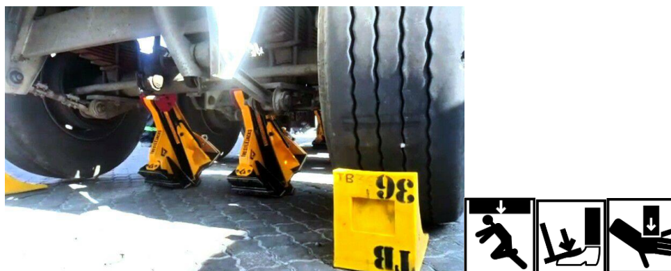
Illustration 2: Lifting an axle or entire empty trailer