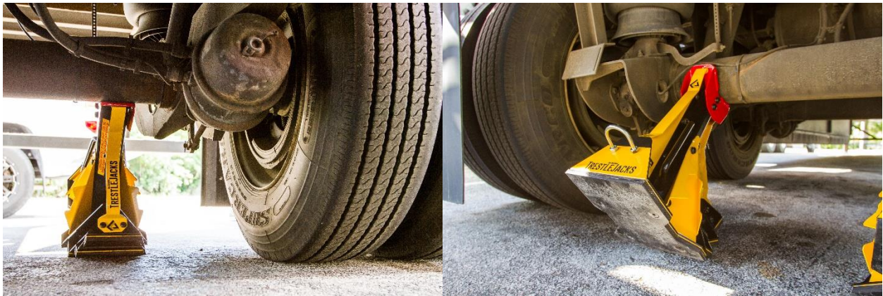
Illustration 1: TrestleJacks in loading position.