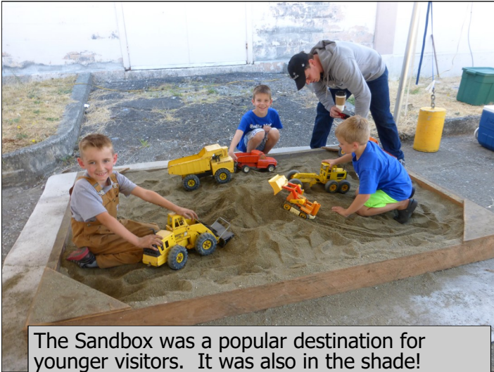
The Sandbox was a popular destination for younger visitors. It was also in the shade! (Below)