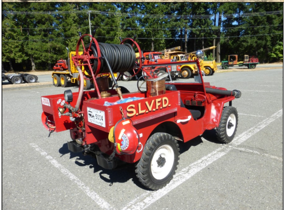
(left) The Smallest Fire Truck" - "Mabel" Sproat Lake V.F.D. brought their fire-fighting little "Jeep".