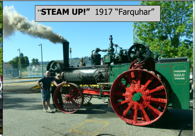
"STEAM UP!" 1917 "Farquhar"