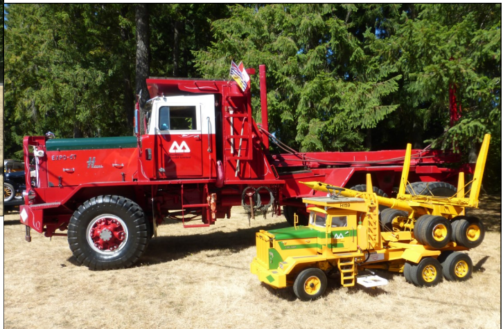
(Above) "Big and Small" 1966 "Hayes" HDX with 1/3 scale model "Challenger" completed by Hank Bakken this year.