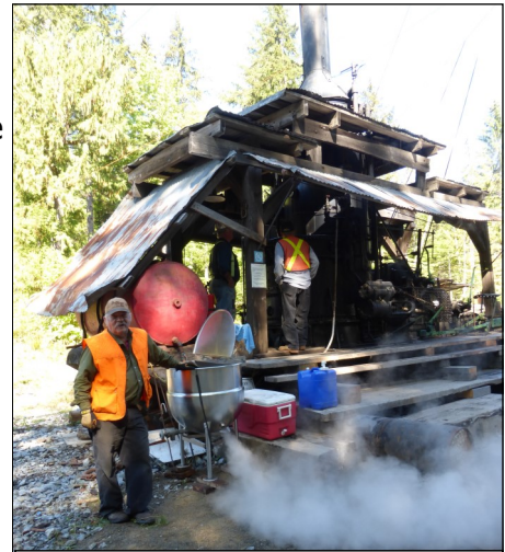
Ken Fyfe & 'Steam Pot Café' (Below) Students on Crosscut Saw