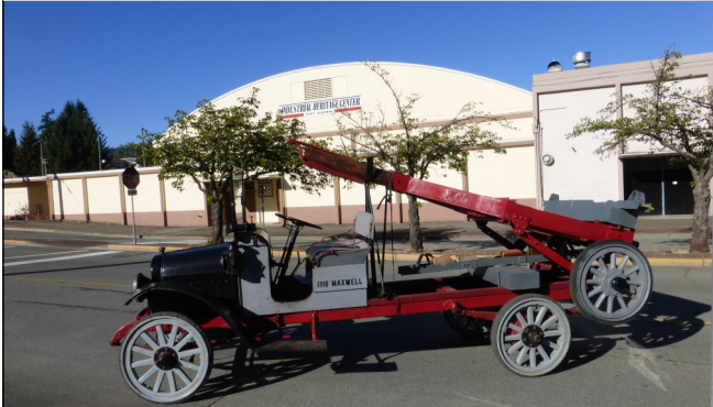
1918 "Maxwell" log truck from BCFDC (Duncan)

The IHC "Steam Team" had the "Farquhar" (100th birthday!!) powering their display, which included steam whistles this year. The 1882 "Strathcona" Parlour car was on display inside the IHC, where visitors also enjoyed perusing Don Watt's many logging photo albums.