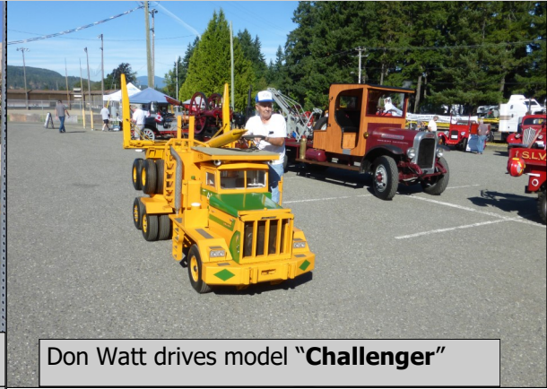
Don Watt drives model "Challenger"

BOAT BASIN behind the Industrial Heritage Centre