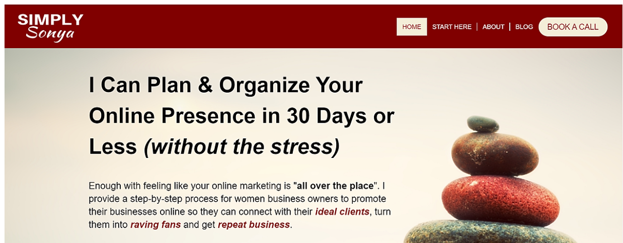
SIMPLY SONYA - Stress free digital marketing solutions.