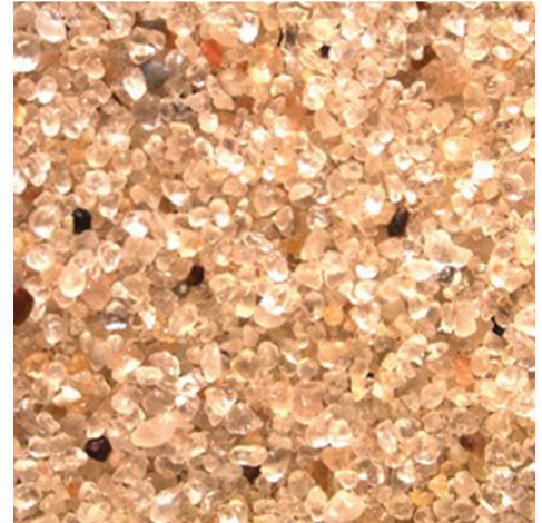
SQS 40/70 standard sand suits technical and economic requirements for wells with normal closure stress.

All sources for this proppant are carefully selected for quality with properties that ensure the proppant's ability to withstand typical downhole environments without degradation and maintain a conductive pathway after fracture closure.