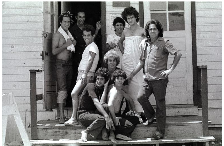
Cuban refugees at Fort Indiantown Gap, 1980

This groundbreaking exhibit, With Open Heart and Open Arms: LGBTQ Cuban Refugees and the LGBTQ Community's Response to the Mariel Boatlift , is now being adapted to become the next traveling exhibit in a collaborative effort with our History Project through the PA LGBT History Network.