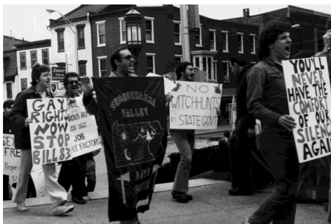
First gay rights demonstration held in Harrisburg, protesting anti-gay legislation introduced into the Pennsylvania legislature, 1977

activists came together to form the PA Rural Gay Caucus, which led to the first gay lobby days, the first statewide gay conferences and the first gay protest marches in the state outside of Philadelphia. The book covers the local response to the HIV/AIDS crisis, the work for passing local non-discrimination ordinances, the lesbian movement, the rise of Pride celebrations, providing safe space for LGBTQ youth, the transgender movement, election of local LGBTQ politicians, the development of the LGBT Center and many other topics.