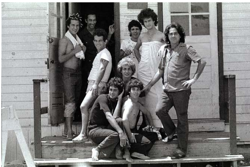
Cuban refugees at Fort Indiantown Gap, 1980

This groundbreaking exhibit, With Open Heart and Open Arms: LGBTQ Cuban Refugees and the LGBTQ Community's Response to the Mariel Boatlift , is now being adapted to become the next traveling exhibit in a collaborative effort with our History Project through the PA LGBT History Network.