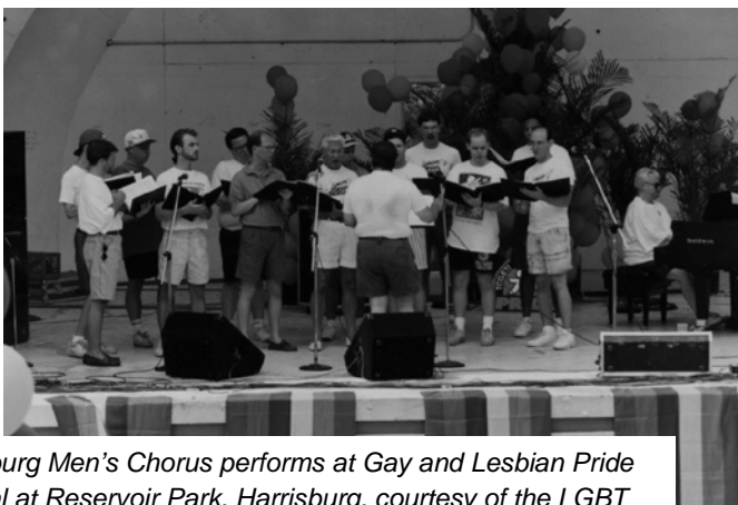
Harrisburg Men's Chorus performs at Gay and Lesbian Pride Festival at Reservoir Park, Harrisburg

It discusses the development of the first gay and lesbian organizations and first activists and leaders in several small cities in PA, and the beginning of campus organizing at Penn State. It chronicles efforts by Governor Milton Shapp to prohibit discrimination based on sexual orientation and gender identity for state employees and in the policies and programs of all state agencies. It is through this effort that many of the early leaders and activists came together to form the PA Rural Gay Caucus, which led to the first gay lobby days, the first statewide LGBTQ+ conferences and the first LGBTQ+ protest marches in the state outside of Philadelphia. The book covers the local response to