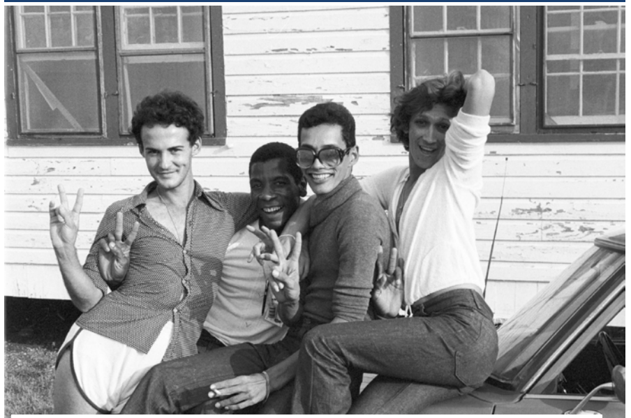
Cuban refugees at Fort Indiantown Gap, 1980