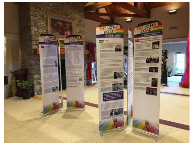
The Bucks County Visitor Center was one of the first stops for our traveling exhibit, The Long Road.

The Long Road to LGBTQ+ Equality in Pennsylvania , our traveling history exhibit that chronicles the efforts that activists have undertaken in Pennsylvania to achieve full equality for LGBTQ+ people, has been shown to thousands of people all over the state from Philadelphia to Erie and many stops in between, at nearly 50 venues. After February 2020, one copy of the exhibit will continue to travel upon request.