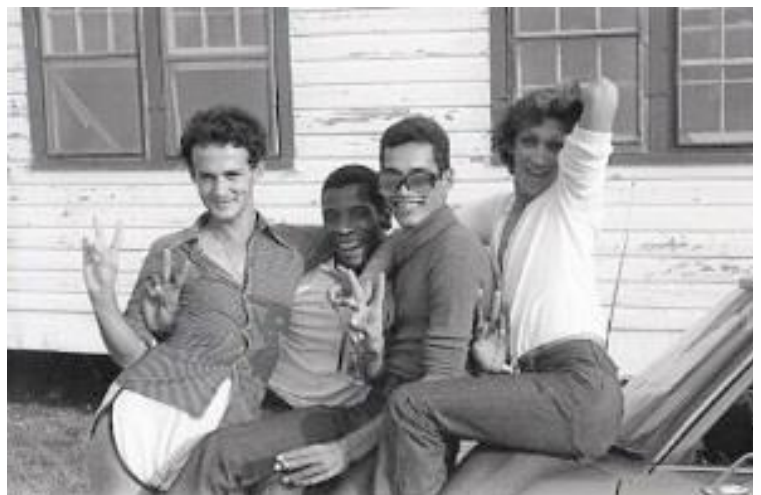
LGBTQ Cuban refugees pose at Fort Indiantown Gap in 1980

This groundbreaking exhibit, With Open Heart and Open Arms , is now being adapted to become the next traveling exhibit in a collaborative effort with our History Project through the PA LGBT History Network.