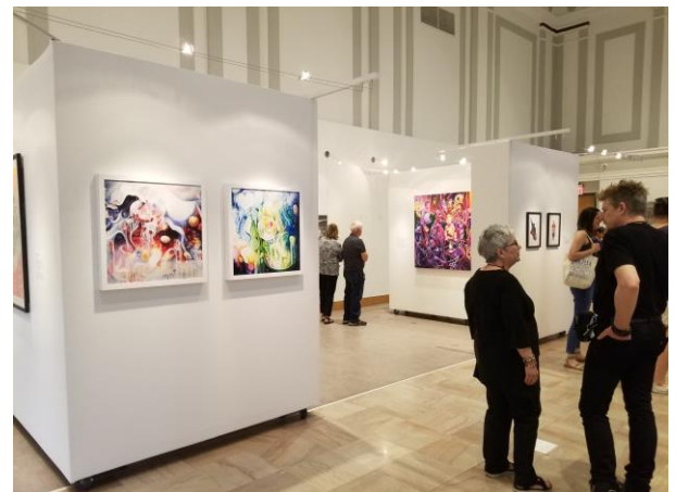
Reception at the Susquehanna Art Museum for our art exhibit, Inspired.

We held our first LGBT History Roadshow in the Keystone Building, in Harrisburg, on October 22. Although no one brought us new collections, quite a few visitors stopped by and enjoyed seeing a pop up exhibit of historical photographs, documents, and artifacts. This event gave us the opportunity to partner with The State