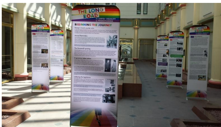
The exhibit set up in the East Wing of the PA State Capitol in Harrisburg.