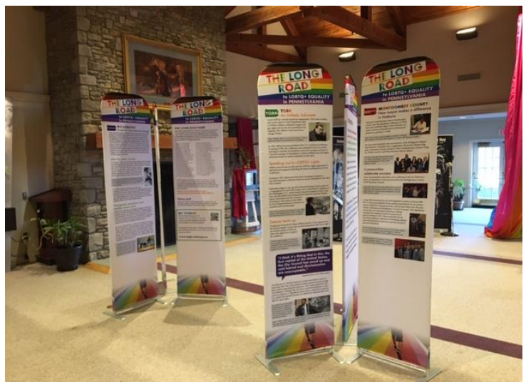
The exhibit makes its first appearance at the Bucks County Visitor Center in Bensalem, PA.

The Long Road to LGBTQ+ Equality in Pennsylvania is a traveling history exhibit that chronicles the efforts that activists have undertaken in Pennsylvania to achieve full equality for LGBTQ+ people. With the lack of success in passing statewide legislative protections from discrimination in housing, employment, public accommodations and education, activists have been working for more than five decades to obtain these protections one battle at a time, one municipality at a time. The exhibit uses case studies of several cities and townships to highlight not just the political struggles, but