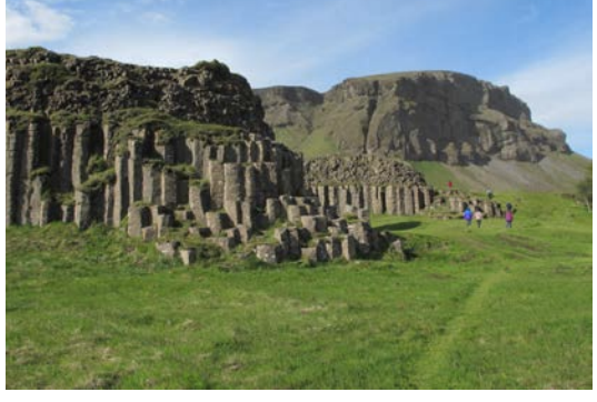
Pillars of columnar basalt