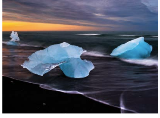
Stranded glacial ice - the Diamond beach

Our tour takes us 100 miles along "Vatnajökull" Glacier, the largest of all the glaciers of Europe. We will visit Skaftafell National Park, with beautiful vistas looking south out over the vast sandur region that we crossed earlier. We'll see stunning glacier outlets of the Vatnajökull Ice Cap and Iceland's highest peak, Öræfajökull, 2,110 m. (6,900 ft.) high.