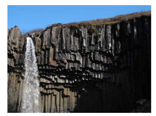
Svartifoss basaltic columns

We leave Selfoss in the morning, driving through several small, quaint villages stopping at the picturesque Seljalands waterfall, where we can walk all around and behind the falls! Then on to the grand 180 foot-high