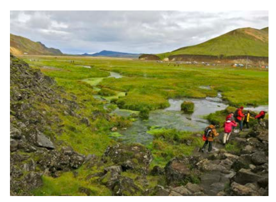
Near the hot springs at Landmannalaugar