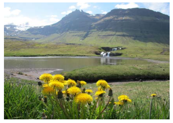
Scenery near Stykkisholmur

Today's drive takes us through the Hvalfjördur tunnel into the rolling fertile Borgarfjördur agricultural district known for its beautiful landscape and mountains.