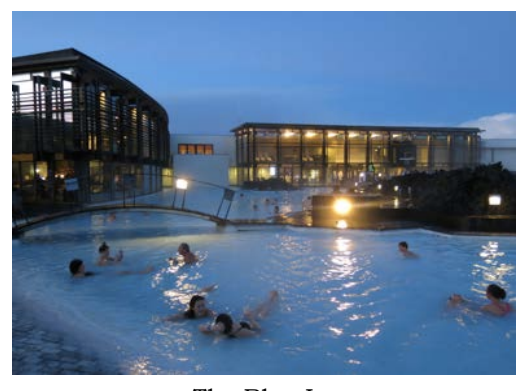
The Blue Lagoon

10th day. September 11th THE UNIQUE BLUE LAGOON AND FLIGHT BACK HOME (B and L)