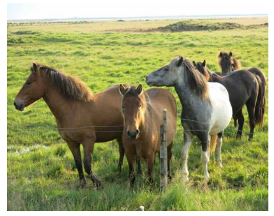
The icelandic horse