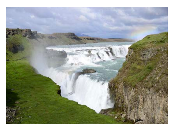
The Golden Waterfall