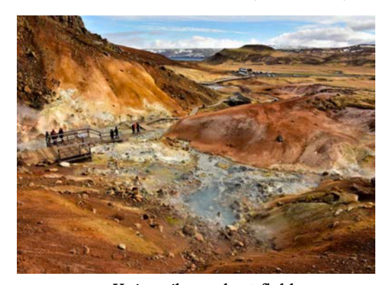
Krýsuvík mudpot field

On our drive from Selfoss along the South-West coastline, we first visit the colorful mudpot fields at Krýsuvík. Enjoy the world famous "Blue