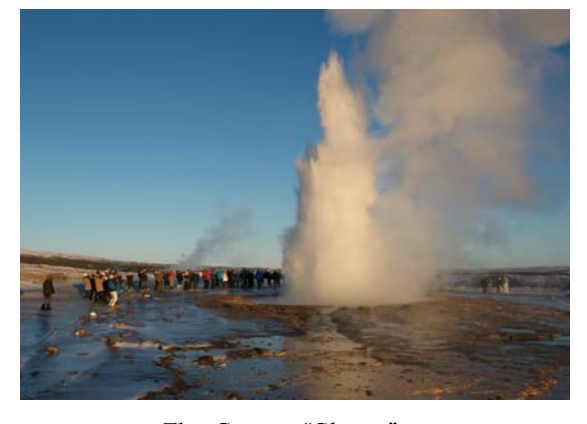
The Geyser "Churn"

We leave Snaefellsnes peninsula in the morning. The tour takes us through farms set in glacier-cut valleys, adjacent to many rivers, and