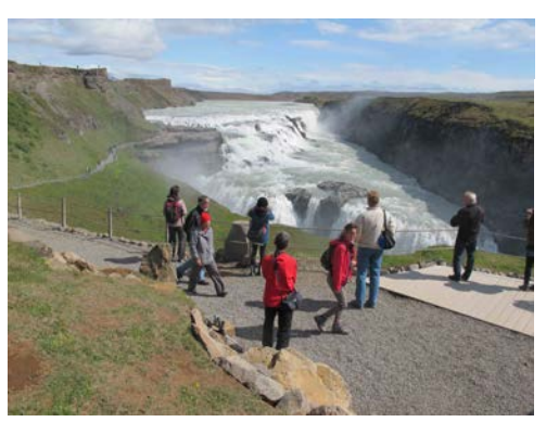
The Golden Waterfall