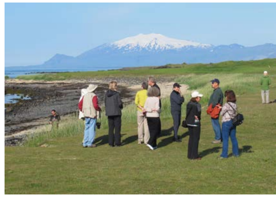
The Snæfells volcano capped by the Glacier

Today we will enjoy a full day around Snaefellsnes. We begin at the picturesque fishing village of Stykkishólmur with a boat excursion to the beautiful Breidafjördur Bay. You will enjoy this boat cruise around the islands to view the scenic splendor. We learn about the varied landscapes of this volcanic peninsula. The great structure of the glacier mountain of Snaefellsjökull dominates the scenery, built up by a succession of lavaflows during the last ice-age and countless flows during the past ten thousand years under open sky. We visit Ytri Vík on the southern coast, which is often a good site for spotting seals. A very enjoyable one-hour walk is planned between Arnarstapi and Hellnar, where we enjoy the craggy and colourful coastline. A myriad of unusual rock structures demonstrate the interaction of ancient, glowing hot lava flows and the cold ocean water. Second overnight at Hotel Rjukandi.