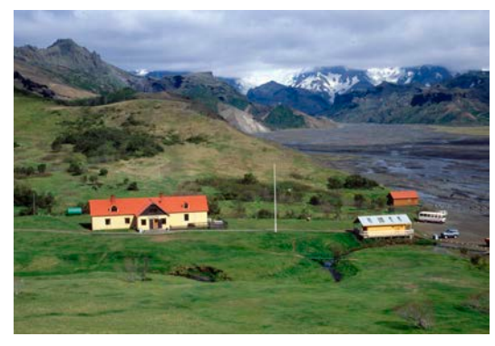
Thorsmörk nature reserve

Thorsmörk (Þórsmörk) is an incredibly beautiful Nature Reserve and a "must see" during your stay in Iceland. It is a favorite among hikers as it offers good access to endless hiking trails in beautiful volcanic land-scape, with views over the three glaciers; Eyjafjallajökull, Mýrdalsjökull and Tindfjallajökull. Getting here is an adventure in itself and part of the way is driven in a specially equipped mountain bus that takes you into the rugged wilderness, safely crossing rough roads and many glacial rivers. On the way we will pass the former Gígjökull glacier lagoon where we will see the results of the famous Eyjafjallajökull volcanic eruption of 2010. Our final destination is the Básar cabin where we will take a leisurely 1\frac{1}{2} hour walk through the mountains, viewing many volcanic phenomena. Drive back to Hotel Selfoss.