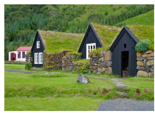
A turf farm