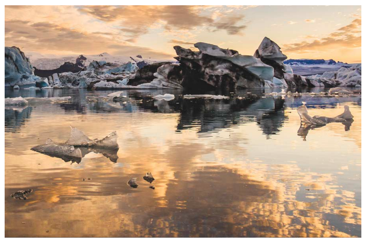
The Glacial Lagoon - Breiðamerkurlón

(See "HIGHLIGHTS: ICELAND TOUR" at end of document for details on the unique nature of this tour)