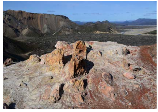
Geothermal area on our walk

Today we enjoy a highlight! We explore some of the interior highlands of Iceland, not visited by most tourists. Landmannalaugar is a paradise of raw nature, shapes and myriad of colours and varied natural phenomena. We hike a spectacular, safe walking path through rough lava fields, hot springs, and fascinating rhyolite mountains with an incredible spectrum of colours. There is also a natural geothermal stream where you can enjoy a hot bath in natural pools among the vegetation. We visit the magnificent Tjörvapollur explosive volcanic crater formed some 500 years ago and encounter a true high latitude, arctic volcanic desert. Overnight at Hotel Selfoss.