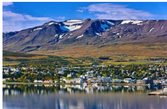
Akureyri, largest town in North-Iceland