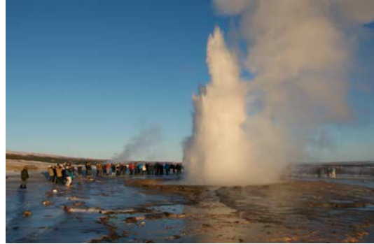
The Geysir "Churn"

We begin with a short drive to the Thingvellir valley basin, located on the spreading Mid-Atlantic ridge. We visit the famous open parliament site of "Thingvellir", where Iceland fostered its independence in the medieval times and where the Icelandic parliament met for over 1000 years. This area boasts some of the most magnificent volcanoes and tectonics in the world. Thingvellir is now a UNESCO world heritage site. The subsiding valley of "Thingvellir" lies astride the North-Atlantic ridge, where the Euro-Asian and North-American tectonic plates diverge from one another at the speed of ~1 inch per year; the same speed as your nails grow! Today we also visit the premier of Icelandic waterfalls, the famous Gullfoss, the spectacular 100 feet-high waterfall which, in the sunshine, so often is embraced with a rainbow in the mist, giving the golden name to the fall. A few kilometers farther, we come to the magnificent Geysir area. During a series of earthquakes 800 years ago, the hot spring "Geysir" was born, later to give such phenomena its name nearly worldwide. Geysir "Churn", is an active spring and spouts every 3-5 minutes up to a height of 60-70 feet. This is followed by a short drive to Selfoss where we spend the second of two consecutive nights at Hotel Selfoss, and where another great dinner is awaiting us!