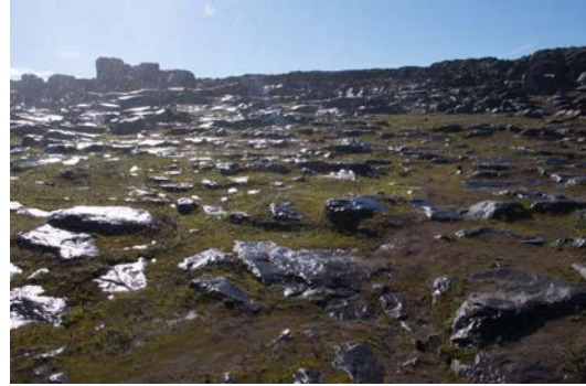
..... settling on rocks on the ground

We begin this day by enjoying the beautiful and picturesque little town Húsavík with its colorful harbor and the unique Russian-Norwegian style church. We enjoy the majestic grandeur of Iceland's geology and landforms. Visit Ásbyrgi prehistoric canyon in its beautiful setting and with its extraordinary saga. Next is Dettifoss, Europe's largest waterfall, tumbling down 150 feet into the fifteen mile long canyon below. We drive through a genuine Arctic Desert, with no or very little vegetation. The American Astronauts trained here in the sixties to study "Moonscapes"! In good weather conditions we can see over 70 miles into the back North-side of the large glacier Vatnajökull, which we encounter in the South-East. We gradually move down to the valleys of East Iceland, from the black into the lush green landscapes. Soon we reach Svartiskógur Hotel, an idyllic place in East-Iceland for our dinner and night quarters.