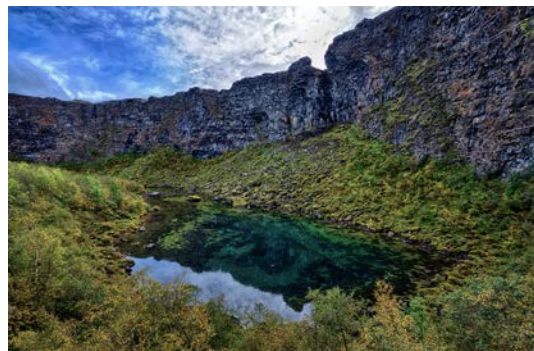
Ásbyrgi fossil Canyon