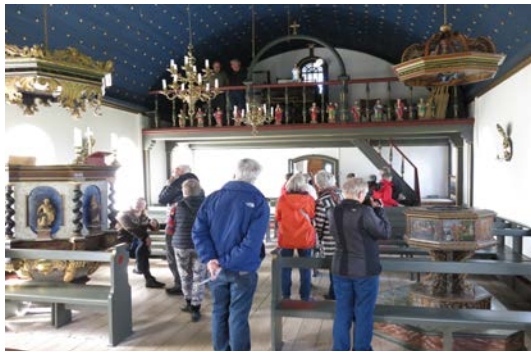
Inside church Thingeyrarkirkja