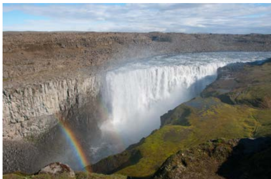
Dettifoss, Europe's largest waterfall