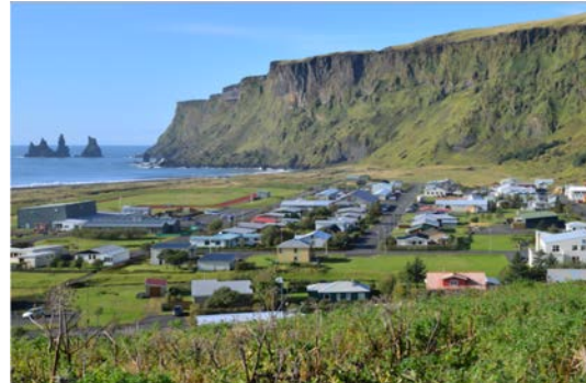
Vík, the southernmost village in Iceland

This morning we learn about the infamous Laki eruption of 1783. This is one of the largest outpourings of lava in historic times anywhere in the world: 230 square miles of glowing rock poured out for eight months and completely covered pastures and farms. The gases of this horrendous eruption killed 20% of the inhabitants of Iceland and 80% of its livestock. Furthermore, the gases and volcanic ash caused greatly diminished sunshine all over the northern hemisphere, triggering lasting famines in Japan, China, North America and in Europe. In France, it is believed to have led to the French Revolution a few years later! Today the Laki lava is covered by thick, beautiful, green moss, a stunning experience to enjoy first hand. We continue driving to the small village of "Vík" by the ocean, with its 600 inhabitants. We stop at the Black sand beach with the picturesque Reynisdrangar, standing like sentinels watching proudly over the South coast. Be careful when massive waves of the Atlantic Ocean break on the shore; they are indeed fast and powerful. Then on to the grand 180 feet-high falls of Skógafoss. And around the corner is the picturesque Seljalands waterfall, where we can walk around and behind the waterfall! Overnight at Hotel Selfoss.