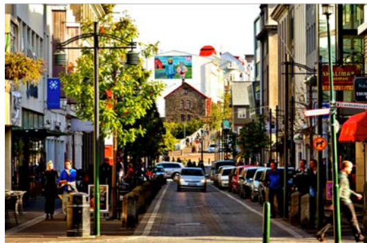
Old town Reykjavik