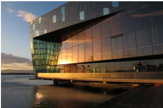
Harpa the Reykjavik Concert Hall