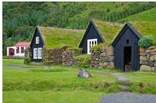
A turf farm