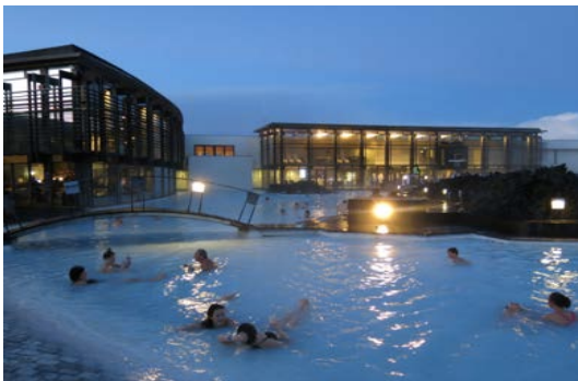
The Blue Lagoon