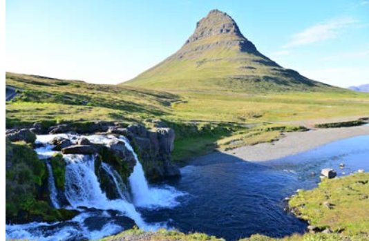
The famous Mt. Kirkjufell

Today's drive takes us through the Hvalfjörður tunnel into the rolling fertile Borgarfjörður agricultural district known for its beautiful landscape and mountains.