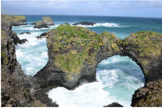
Coastline at Snafellsnes