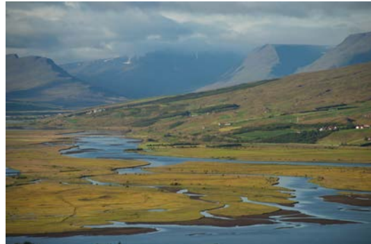
Green valleys of the North

Drive through idyllic countryside, ornamented by crater cones and lush green moss-covered lava fields on way to Blönduós in the North of Iceland. We visit a lovely ornamented country church at Thingeyri, the site of the first medieval Catholic Convent in Iceland, Benedictine monastery established in 1133. In this part of the country there is the lovely Icelandic horse all around. We stop to get near to these amicable animals. Today there are numerous sights, landscapes and interesting natural phenomena awaiting us! Overnight in the small picturesque Blönduós village.