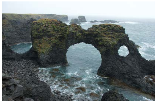
Lava rock formations at Arnarstapi

Today we will enjoy a full day around Snaefellsnes. We learn about the varied landscapes of this volcanic peninsula. The great structure of the glacier mountain of Snaefellsjökull dominates the scenery, built up by a succession of lavaflows during the last ice-age and countless flows during the past ten thousand years under open sky. We visit Ytri Vík on