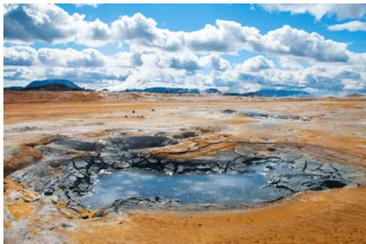
Námaskard Mud Pot Area