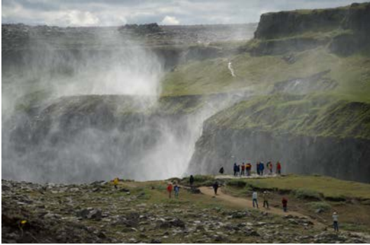
Hurled mist from Dettifoss