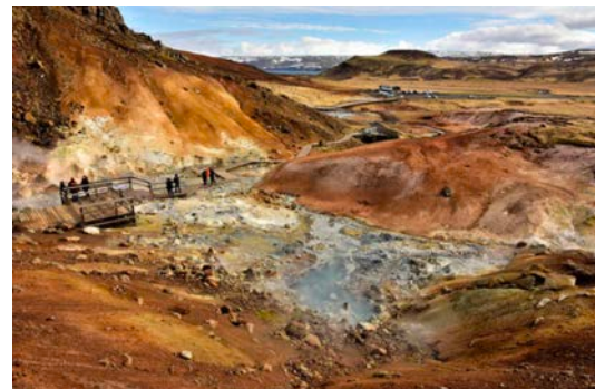
Krýsuvík mudpot field