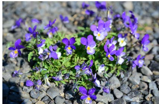
Small and beautiful flowers

Package includes: round trip transfers air and ground. All meals, transportation in Iceland, gratuities and a 13 days Program (12 in Iceland). Activity level - Active