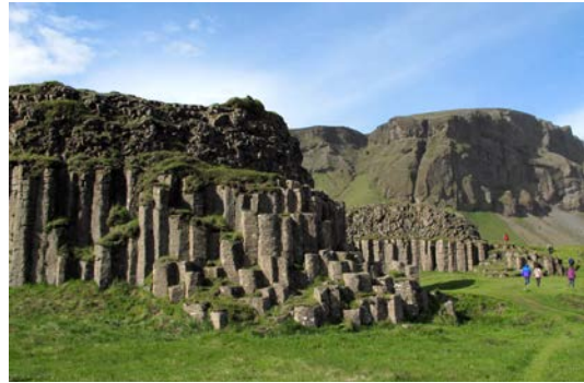
Basalt columns at "Dverghamrar"