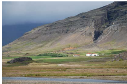
Berufjördur and the dyke

Today we drive through the oldest rock pile of Iceland, created some 16 million years ago. The route takes us through many fjords, by many small villages on our way to Höfn town in the South-East. Mountains, mountain ranges and the many fjords characterize this part of the country. Beaches of black sand and lagoons with birdlife. Swans and Great northern Divers dwell on the lakes. We come into the South-East