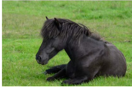
A black horse