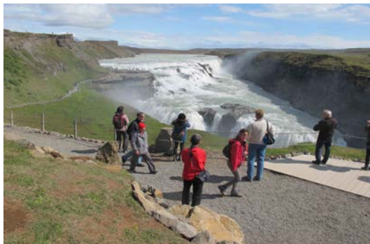
Admiring the Golden waterfall