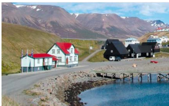
The Hofsós Emigration Center