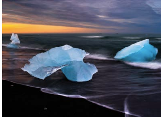
Stranded glacial ice – the “Diamond beach”