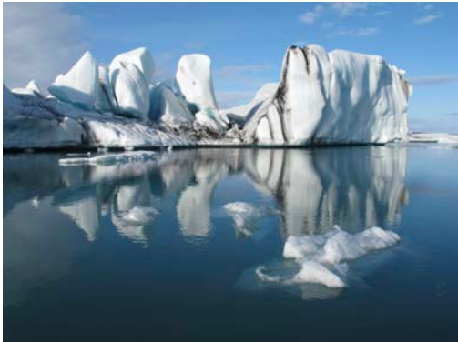
Bizarre giant on the Glacial lake