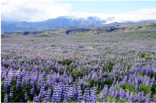
The Alaska lupine richly decorates the land