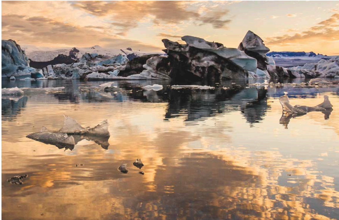
The Magical Glacial Lagoon – Breiðamerkurlón

August 18 th (Tuesday) to August 30 th (Sunday) 2020, 13 days Program, 12 days in Iceland. All-inclusive (three meals a day, all transportation, all admissions, hotels, museums outside Reykjavik). Min. participation: 10; max. 21.