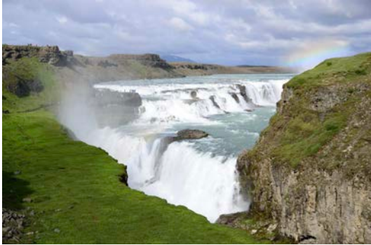
The Golden Waterfall